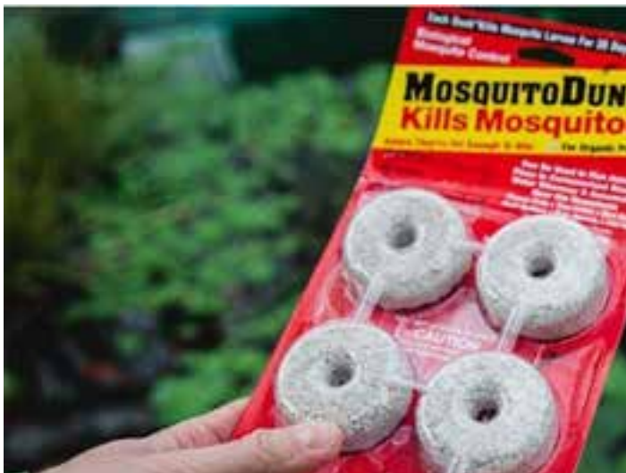
Dunks utilize natural bacterium to inhibit larvae in reservoirs which collect water.

Eliminating nearby standing water sources is an easy, no-cost way to inhibit mosquito breeding. With a little diligence, your yard could see its mosquito population plummet surprisingly quickly without the need for costly, risky chemicals.